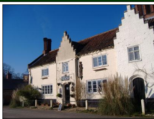
The Earle Arms

FLM's first Christmas Meal was held at the Earle Arms at Heydon in December.