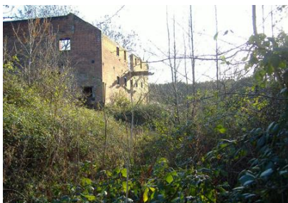
Granary from the road 1 st Jan 07