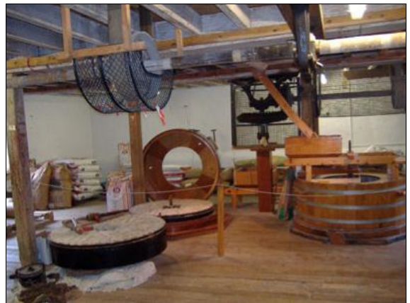
Existing Millstones at Letheringsett. Left. The 'quirky' set of French Burr stones. Right. The working set of Derbyshire grit stones.

There is a second set of stones at Letheringsett, a set of French burr stones. They have been used but are a bit quirky, more flour comes up through the eye of the stones than ends up in the flour shute and it's not known why! And no – it's not French burrs stones used to make flour for French bread. A millwright is going to look at them soon!