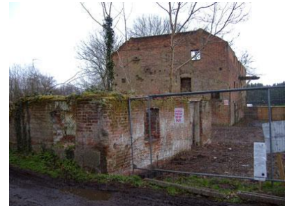
Fenced in by NNDC 21st Mar 08