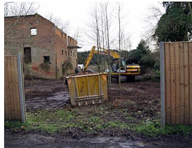
Site clearance in progress 5 th Jan 08